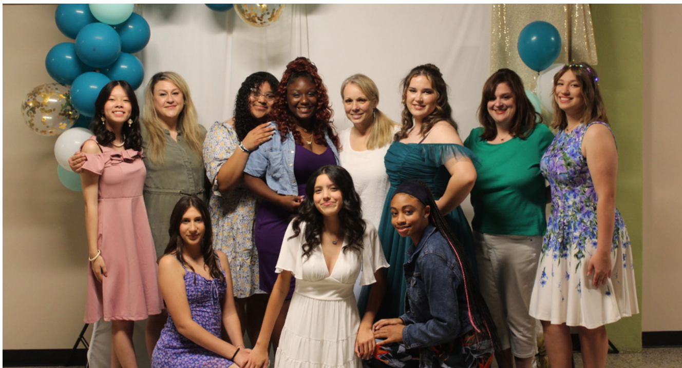
8th Grade Dance Fun!

The latest news and updates from Bissonet Plaza School 6818 Kawanee Ave. Metairie, LA 70003